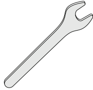
Open-End 7 mm Wrench